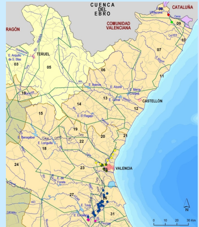
Emergency measures: use of drought wells